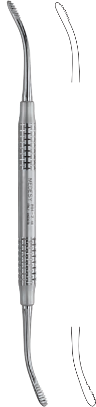
894/2 Wahl mm 180 ø 8 mm