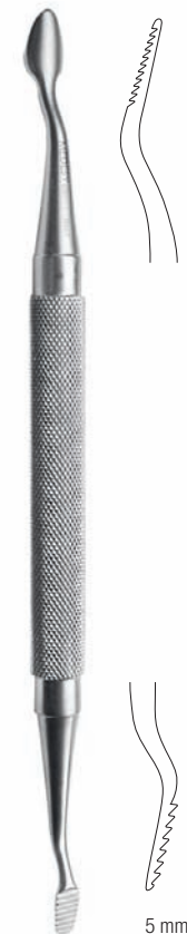
895/1 Miller mm 180 ø 10 mm