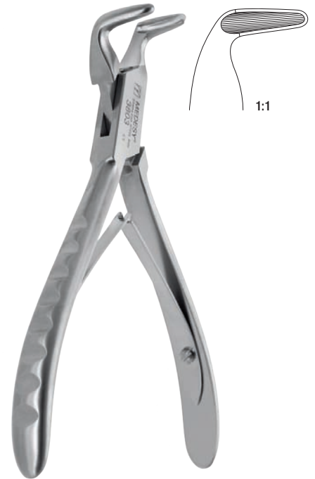
3803 Blumenthal 90° mm 140