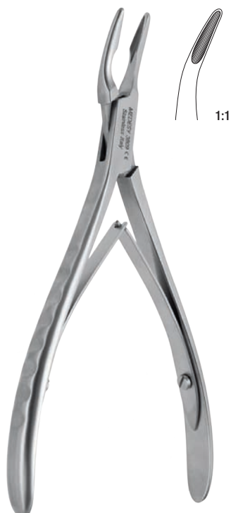
3809 Micro Friedman mm 145