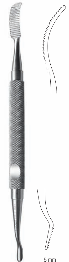
895/3 Miller mm 180 ø 10 mm