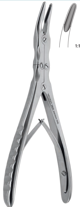
3806 Beyer mm 170