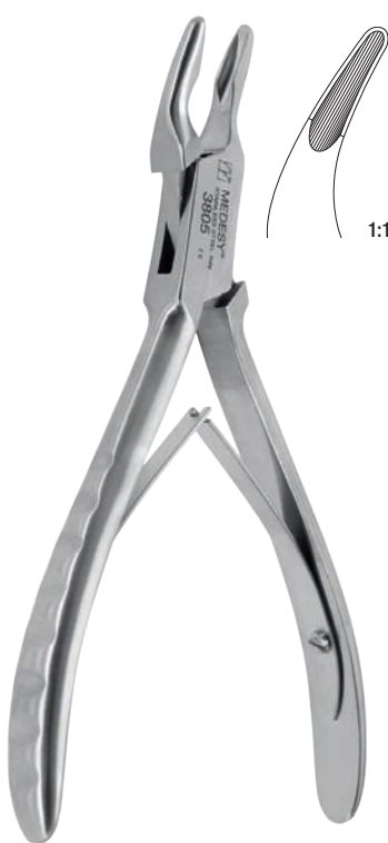
3805 Luer mm 150