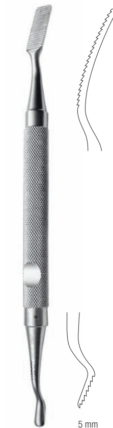
895/2 Miller mm 180 ø 10 mm