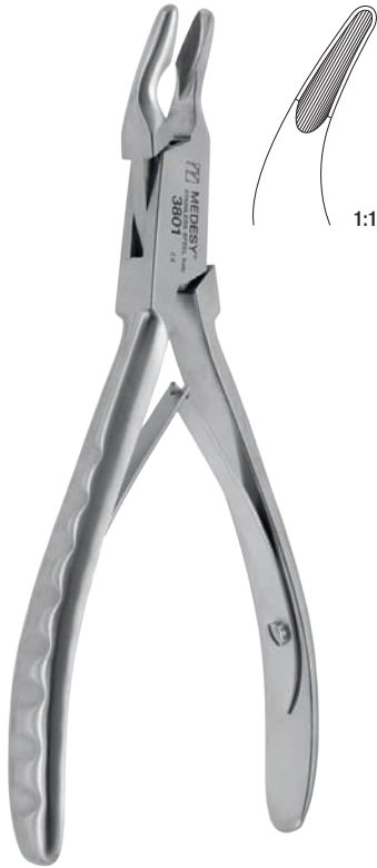
3801 Blumenthal mm 155