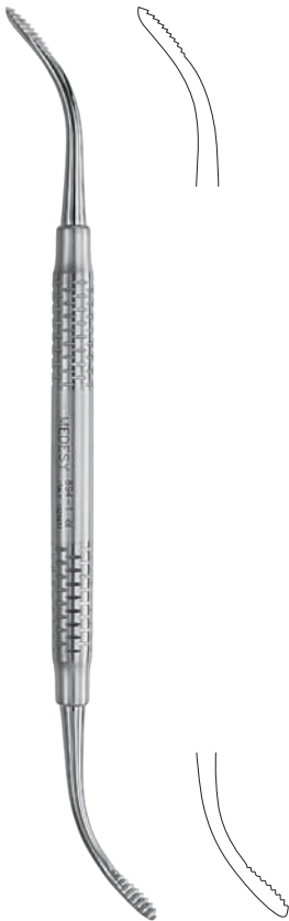
894/1 Wahl mm 180 ø 8 mm