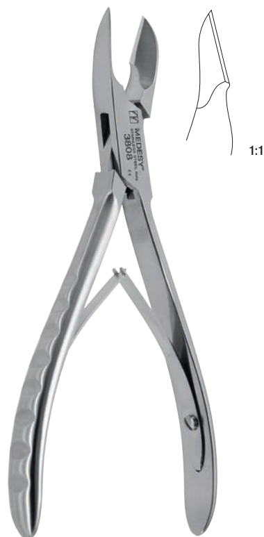
3808 Cleveland mm 155