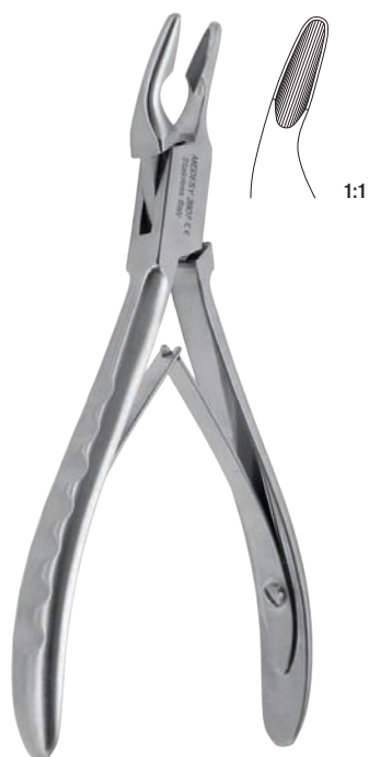
3807 Friedman mm 140