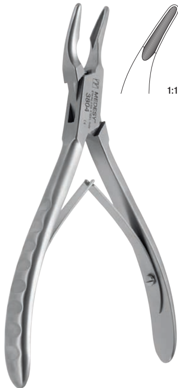
3804 Micro Luer mm 150