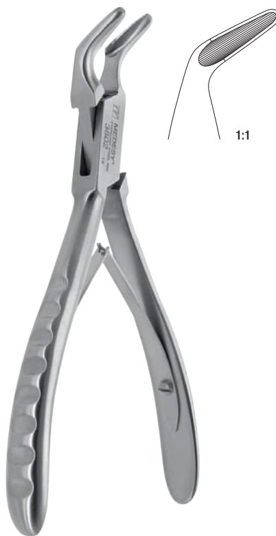
3802 Blumenthal 45° mm 150