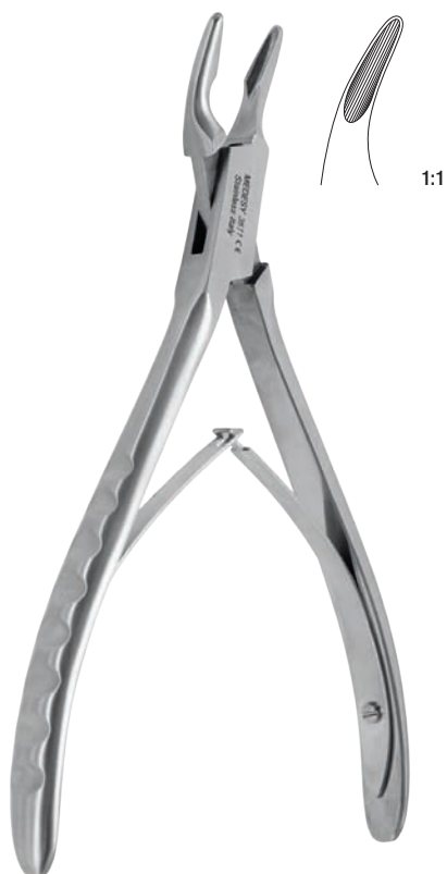
3811 Lempert Delicate mm 160