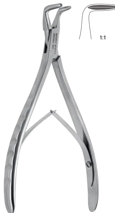
3810 Micro Friedman 90° mm 145